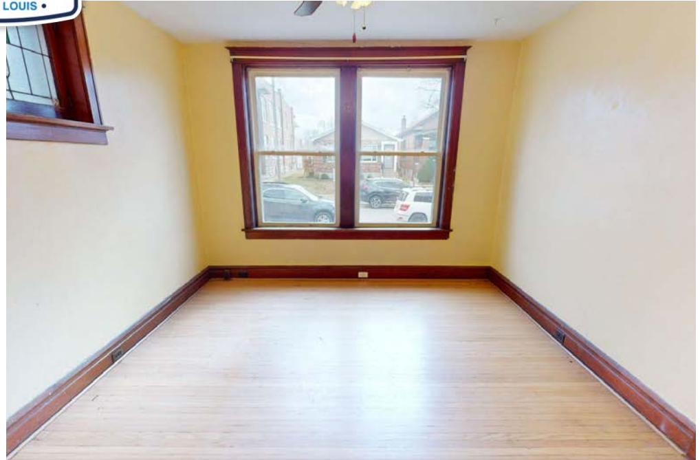
4955 Finkman St