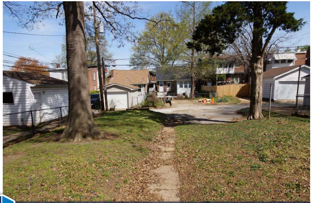
4955 Finkman St