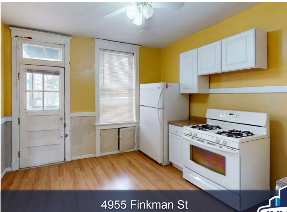
4955 Finkman St