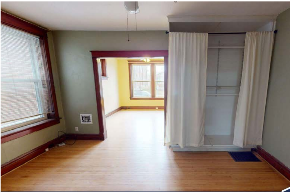
4955 Finkman St