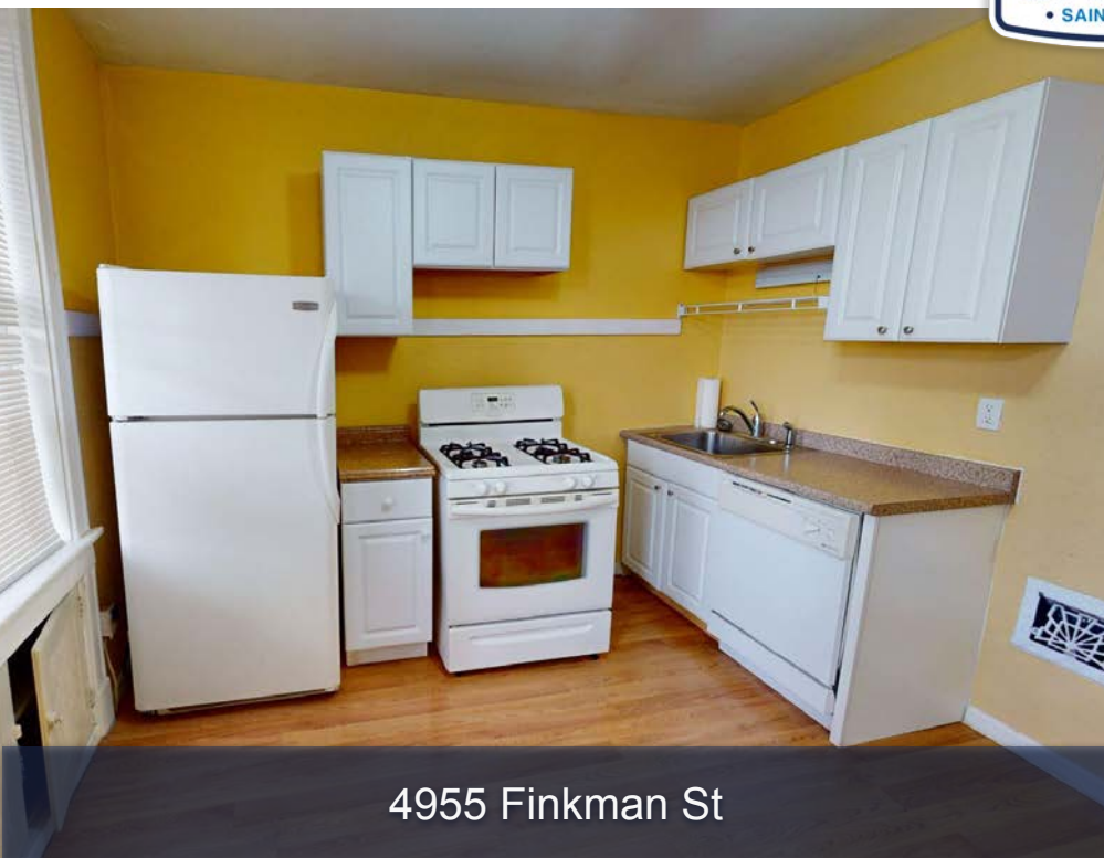
4955 Finkman St