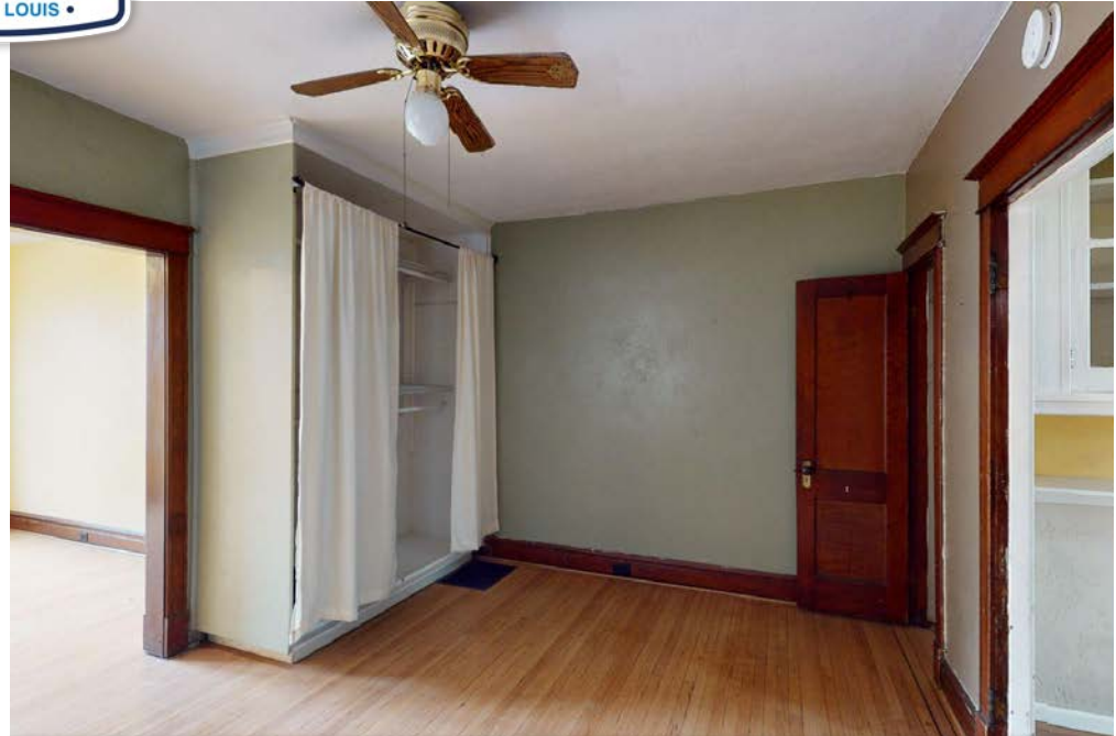
4955 Finkman St