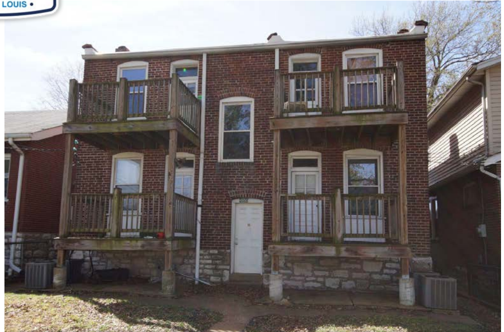
4955 Finkman St