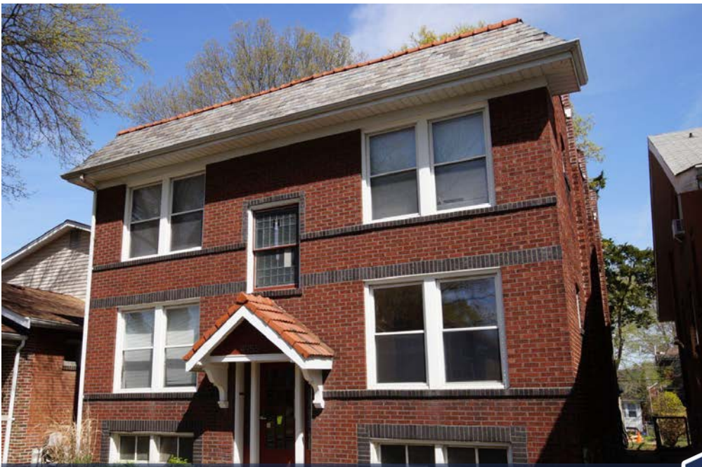
4955 Finkman St