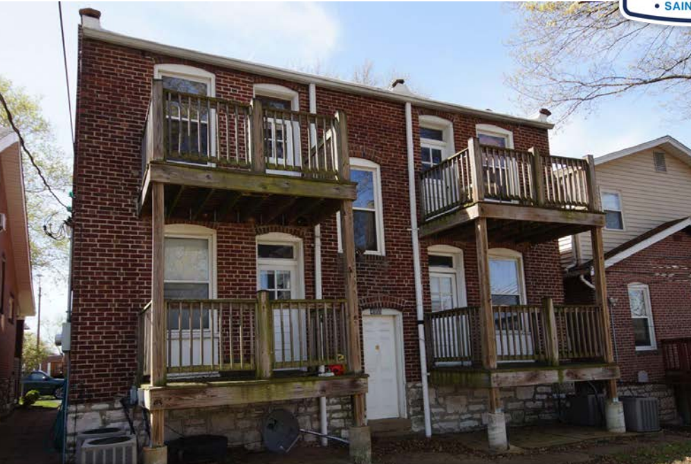
4955 Finkman St