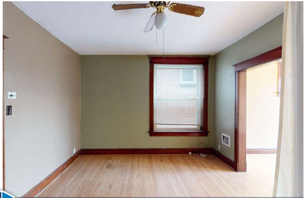
4955 Finkman St