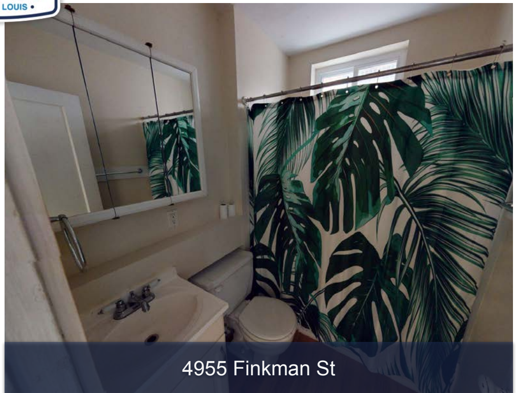
4955 Finkman St