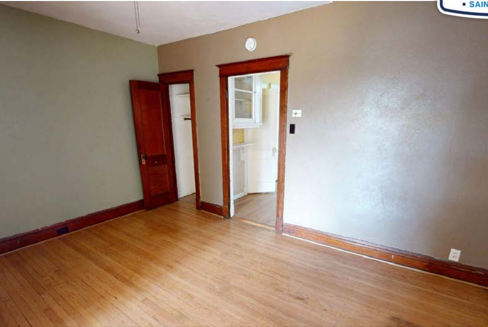
4955 Finkman St