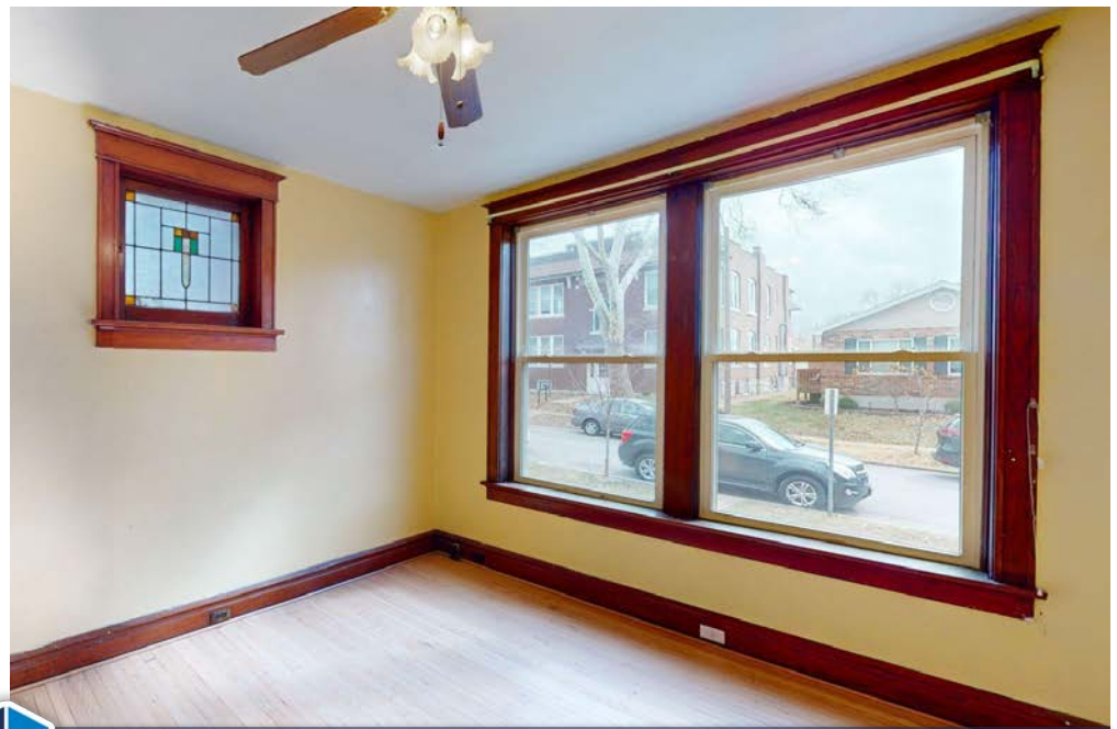
4955 Finkman St