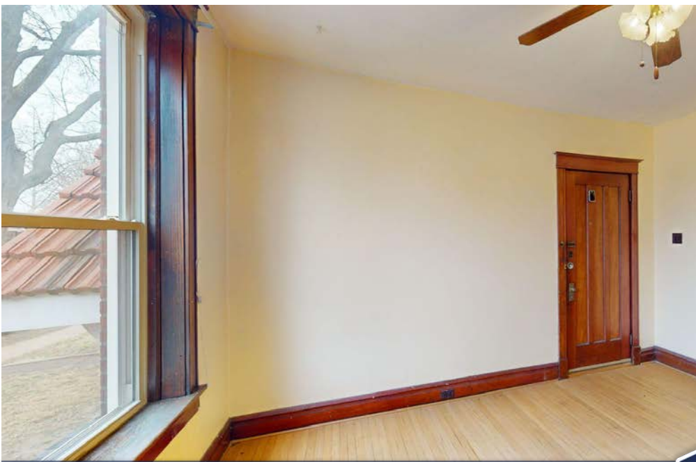
4955 Finkman St