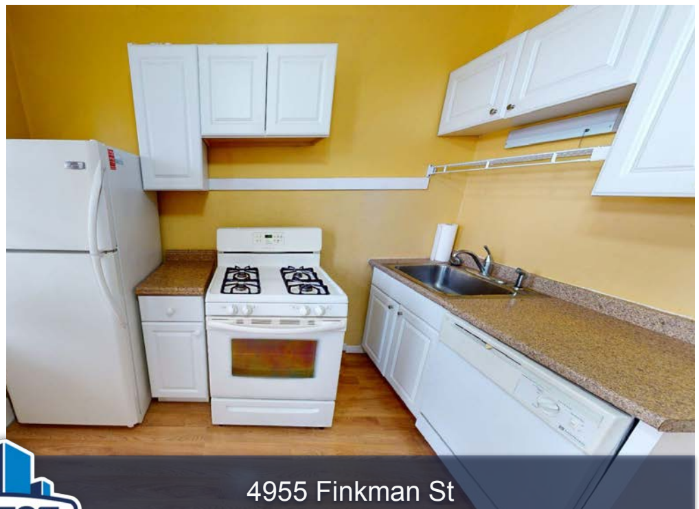
4955 Finkman St