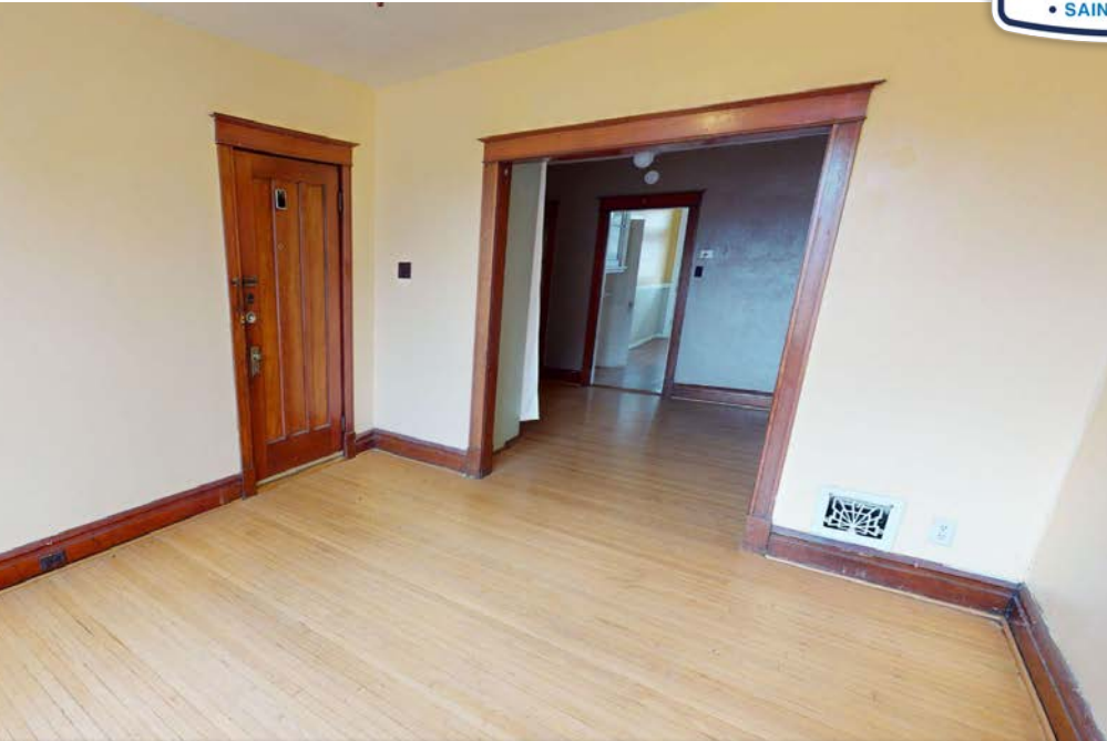
4955 Finkman St