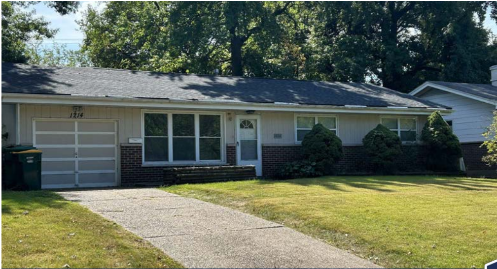
1214 Saint Cyr

12 Turn-Key Single-Family Homes For Sale in North County