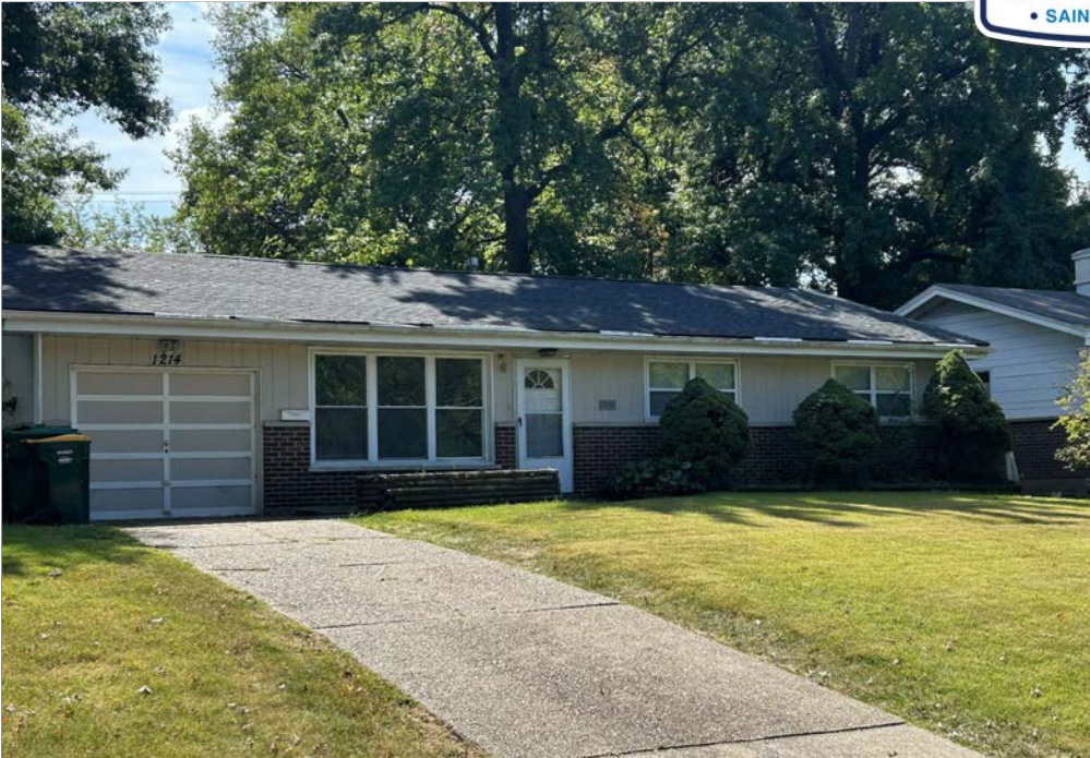
1214 Saint Cyr