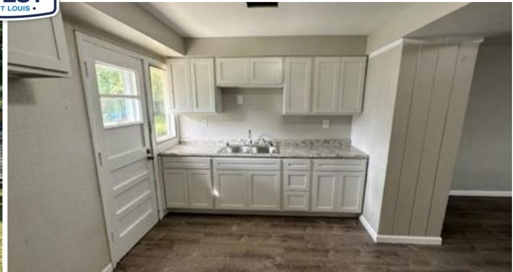
6827 Woodhurst - Interior